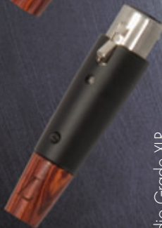
Studio Grade XLR

Like the universally touted KS 1130, the KS 1136 makes use of Black Pearl silver conductors, our dual concentric grounding format, and our sophisticated constrained matrix. With an increase in conductor mass and matching ESD yarn the KS 1136 provides increased low frequency impact and weight and a stunning sense of dynamic coherence at all frequencies.