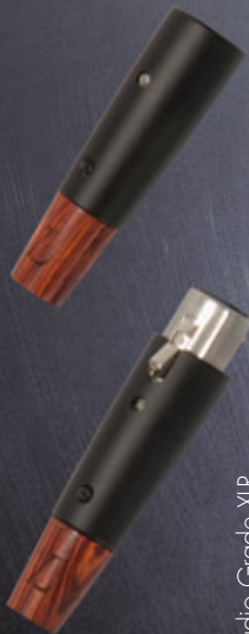
Studio Grade XLR

The KS 1130 is the ultimate in balanced cable technology and performance. Comprised of Black Pearl silver conductors in conjunction with our dual concentric grounding format. The true potential of your balanced equipment will be fully realized with the KS 1130. All aspects of recorded music: soundstaging, harmonic integrity, dynamics (both subtle and great), as well as nuances presented with no limitation or fatigue, are available to those who desire the finest.