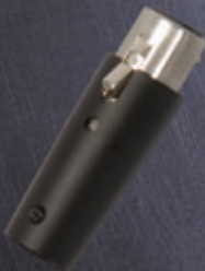
Studio Grade XLR

The design concepts behind this advanced balanced cable began with discoveries regarding earth grounding and its relationship to the signal pair in a differential audio interconnect. This cable employs a dual concentric grounding method along with our unique constrained matrix and orthogonal geometry. The conductor is Hyper-pure, molecularly optimized copper.